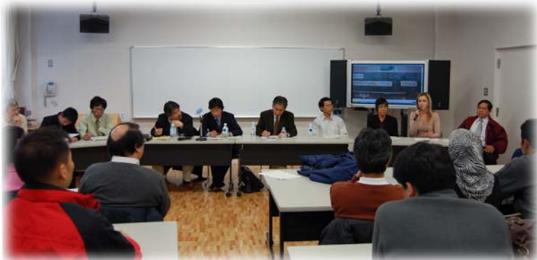
December 6: Lesson Study in Maruyama Elementary School