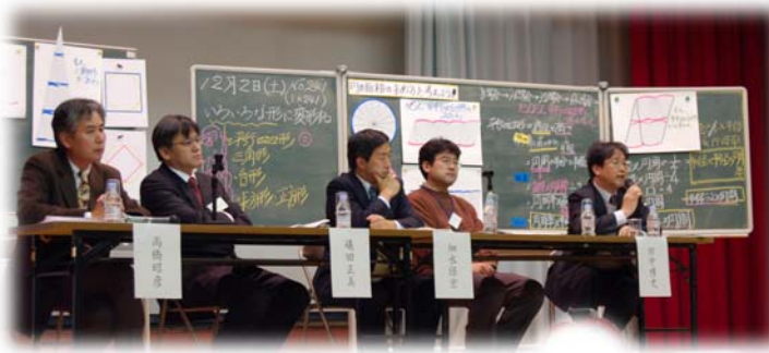
December 2: Lesson Study in Attached Elementary School of the University of Tsukuba