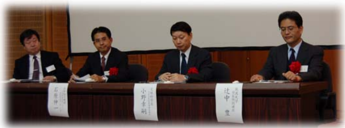
December 3: APEC Open symposium (Tokyo)