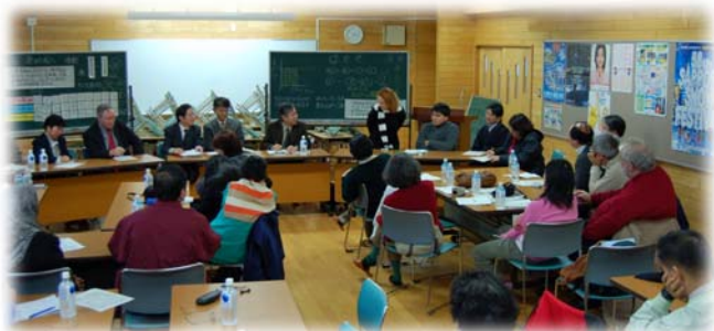
December 5: Lesson Study in Hokuto Elementary School