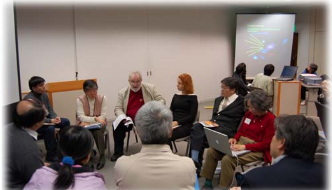
December 5-7: Specialists Session