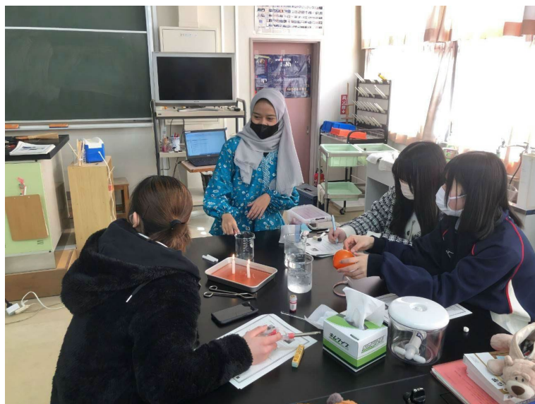
Teaching Practice of a student-teacher from Universitas Pendidikan Indonesia at Sakado Affiliate High School