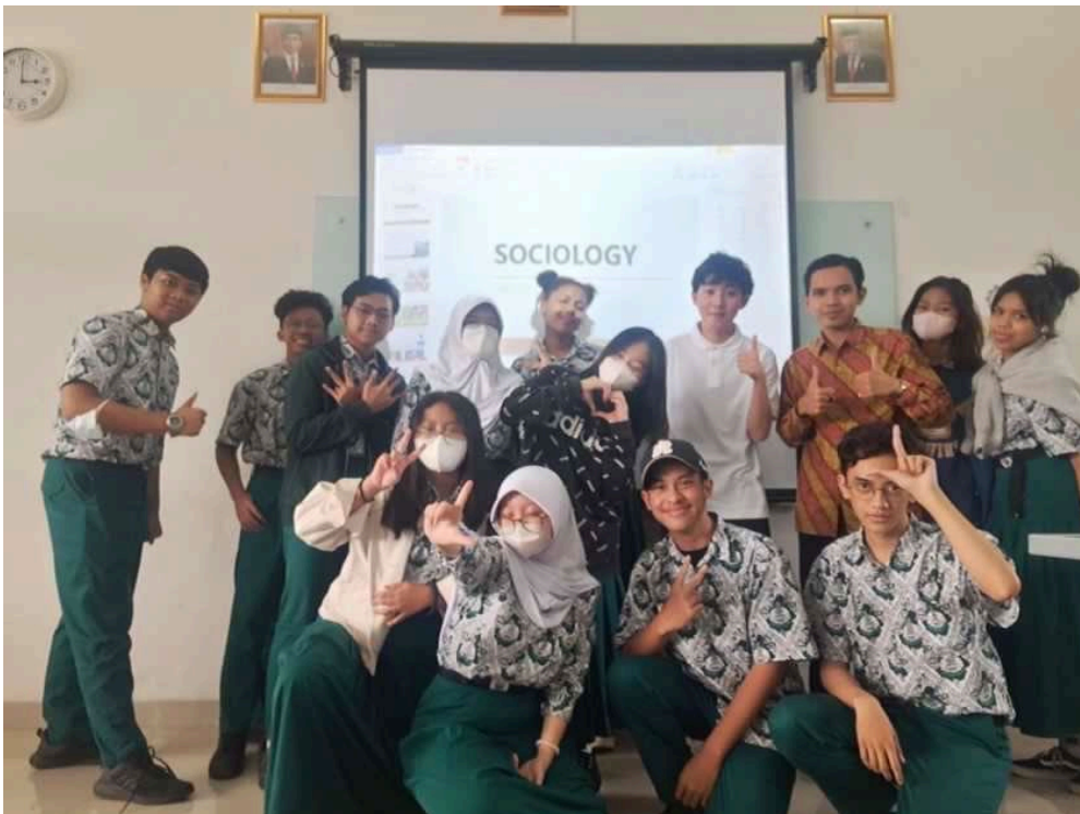
Group Photo with the students of Universitas Pendidikan Indonesia