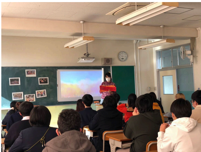
Teaching Practice of a student-teacher from Khon Kaen University at Sakado Affiliate High School