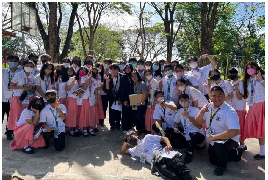
Group Photo with the students of Central Luzon State University