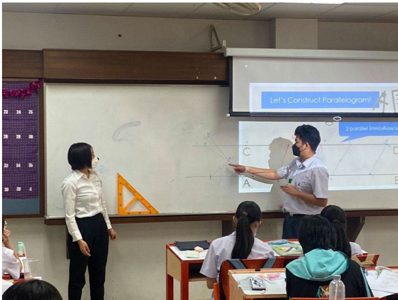
Teaching Practice of a student from University of Tsukuba at Kohn Kaen University