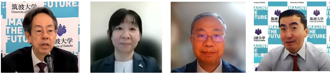
Opening ceremony for APEC (Online)