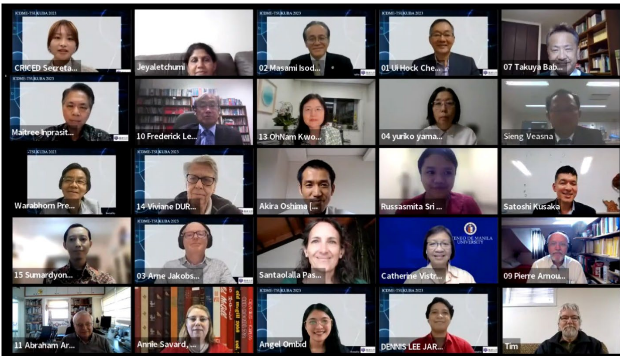
Group Photo taken at the Photo Session (ICDME)