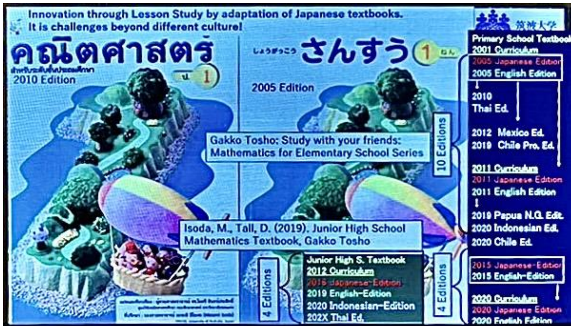
Photo 3: Study with your friends: Mathematics for elementary School (Thai Version) and its development from English to other language versions