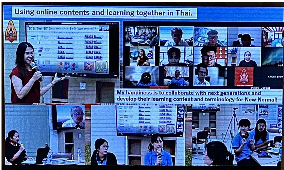
Photo 5 : Khon Kaen University Master's Program using CRICED Development Online Course

Conference Site https://imsed.ipst.ac.th/